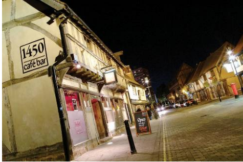
Medieval Spon Street

In addition to the main tourist attractions, Coventry also offers a rich cultural environment for visitors, with a variety of nightlife venues available.