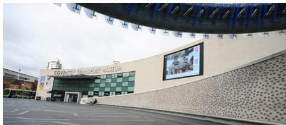
Big Screen Live Site at Millennium Place