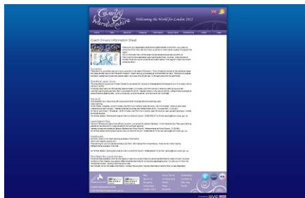
Coventry & Warwickshire Tourism Website

Clear information is provided to visiting coach parties through a variety of readily available sources, with the most effective method of conveying this information to visitors located throughout the Country and further afield is through the use of the Internet. Whereby a dedicated website has been produced for coach drivers visiting Coventry and Warwickshire: