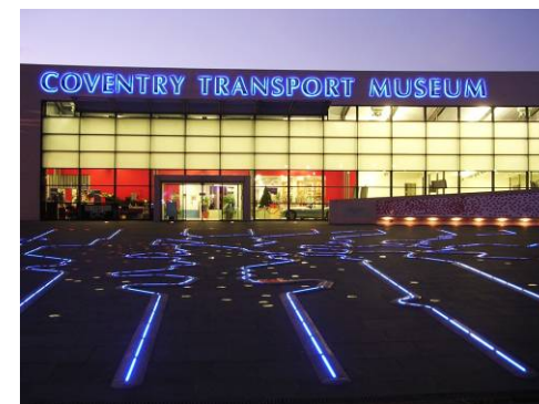
Coventry Transport Museum