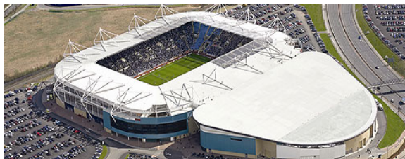
City of Coventry Stadium