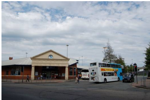
Pool Meadow Bus Station

The coach park facility is located within the heart of the city and in close walking distance to a number of the key tourist attractors and city centre shops. This has the added benefit of reducing the environmental impact by minimising the amount of travel required for coach drivers. One of the major benefits to having a coach park located within the city centre is that coach passengers and coach drivers alike are located in close proximity to the array of local amenities located within the city centre, such as cafes, bars, supermarkets etc all situated within a short walk of the coach park.