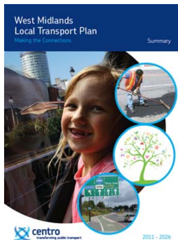
Local Transport Plan 3

Policy REG5 : To identify adequate long-stay coach parking facilities convenient to town and city centres and near major attractors during daytime and evening hours.