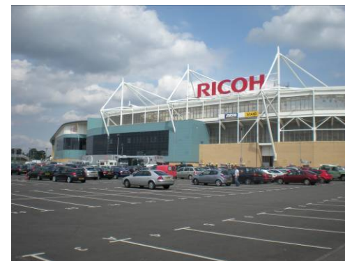
Ricoh Arena Car Parks

The Ricoh Arena boasts more than 2,000 car parking spaces and dedicated secure long stay coach parking for up to 50 coaches. Coach drivers have access to the welfare facilities including a choice bars and restaurants and public toilets. The stadium will be renamed as the City of Coventry Stadium during the Olympic Games Events.