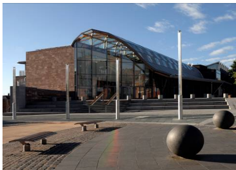
Herbert Art Gallery

The Herbert Art Gallery and Museum has recently completed a £20 million redevelopment which has transformed the site. With 8 new permanent galleries, temporary exhibitions and events spaces, education spaces, a new History Centre and Herbert Media studios. The collections cover a wide range of material associated with or collected for the people of Coventry, and include collections of Archaeology, Natural History, Social and Industrial History and Visual Arts. In addition the History Centre holds collections of published and original documents.